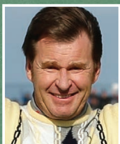
SIR NICK FALDO