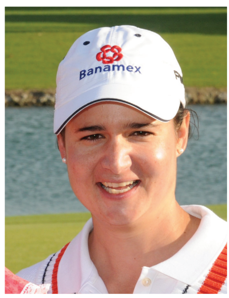
Ochoa walked away from playing professional golf at the height of her career to enjoy the second stage of her life as a wife, mother, businesswoman and philanthropist.

Sports fans never get used to their favorite superstar aging and hanging on to their sport until it becomes obvious the glory years are long gone. For many, Willie Mays is still the greatest baseball player they've seen in their lifetime, but the images of him misplaying balls in the outfield is forever attached to the highlight memories. Few athletes walk away from their sport at the peak of their careers leaving us to wonder what more they may have accomplished. Both Jim Brown and Barry Sanders retired from the NFL following MVP seasons and Michael Jordan stunned the