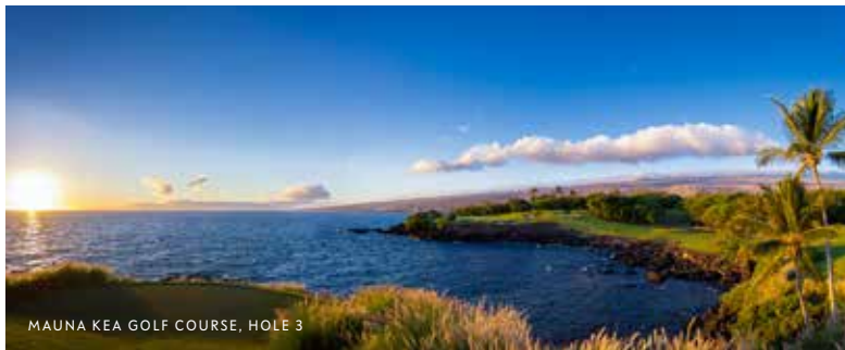
MAUNA KEA GOLF COURSE, HOLE 3