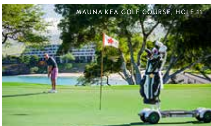
MAUNA KEA GOLF COURSE, HOLE 11

Master the unforgettable today by calling 808-882.5405 to set up a tee time.