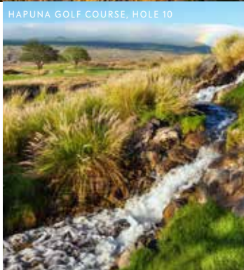
HAPUNA GOLF COURSE, HOLE 10

It's hard to believe that before 1964 golf didn't exist on the Island of Hawai'i.