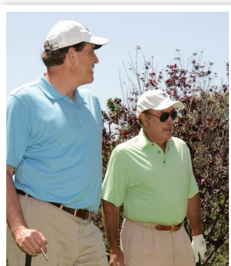
Michaels (right), shown here with fellow legendary broadcaster, Jim Nantz, graduated from Alexander Hamilton High School in Los Angeles where the football stadium bears his name.

There are occasions when a moment in time defines an individual while in other instances an individual defines the moment in time. The latter occurred during the 1980 Olympics when Al Michaels excitedly proclaimed, "Do you believe in miracles?" following the U.S. hockey team of amateurs upsetting the mighty Russian team of veterans. For most broadcasters, that would have been the single highlight of their career. However, Michael's career has been full of highlights, awards, and achievements. Michaels, who will be honored with FOG's 2022 Ken Venturi Spirit