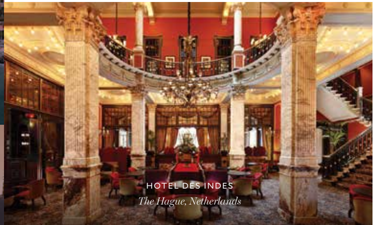
HOTEL DES INDES The Hague, Netherlands