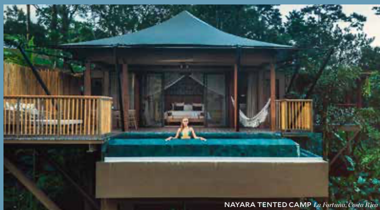
NAYARA TENTED CAMP La Fortuna, Costa Rica

Note: The round must be played on a Tuesday through Sunday after 12:30 PM.