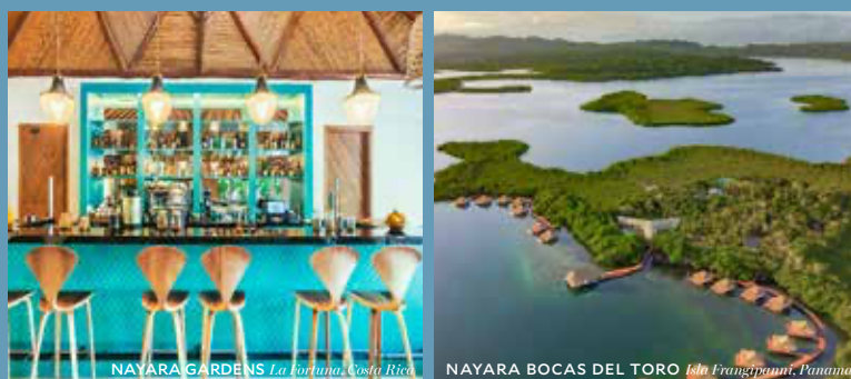
NAYARA GARDENS La Fortuna, Costa Rica