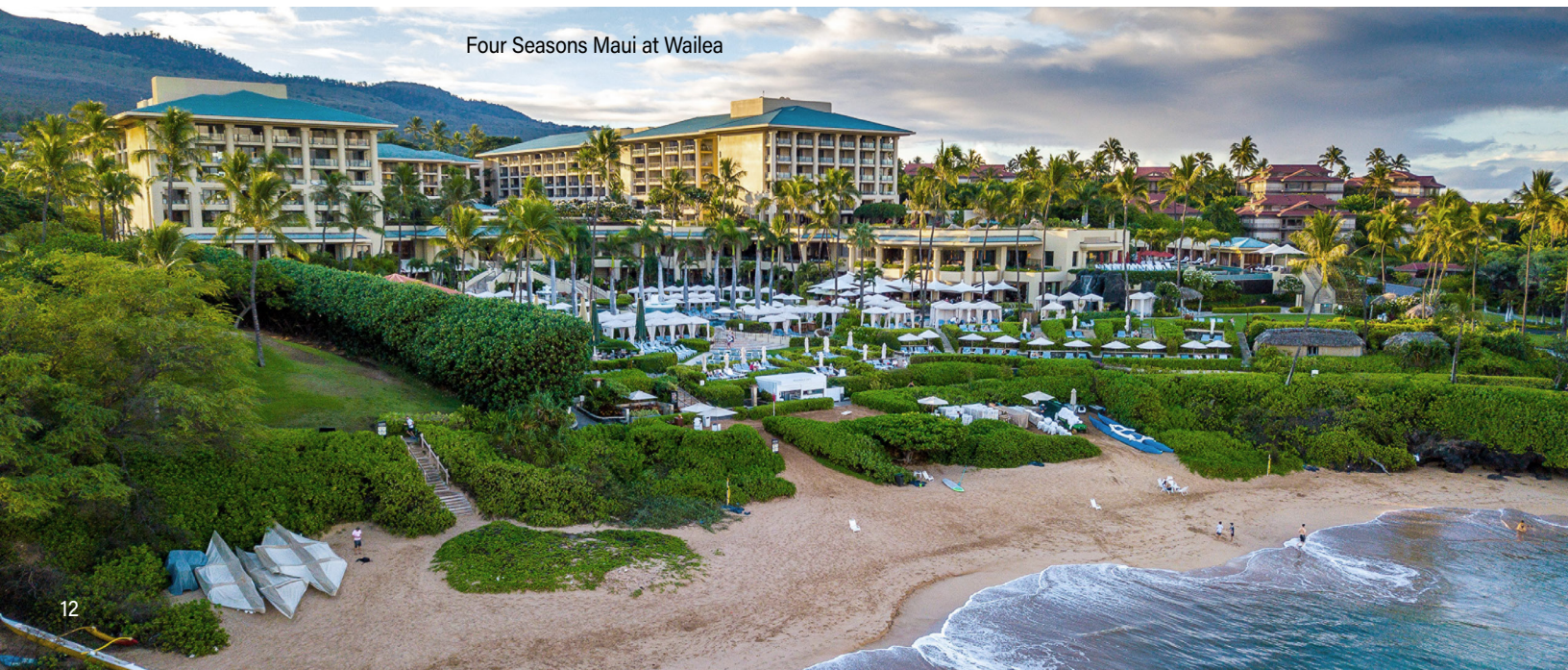
Four Seasons Maui at Wailea